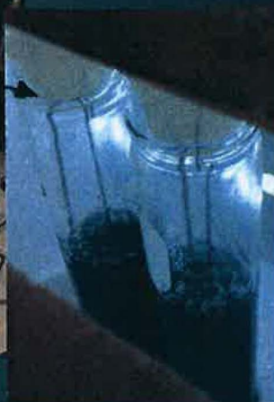
Our working photobioreactor!