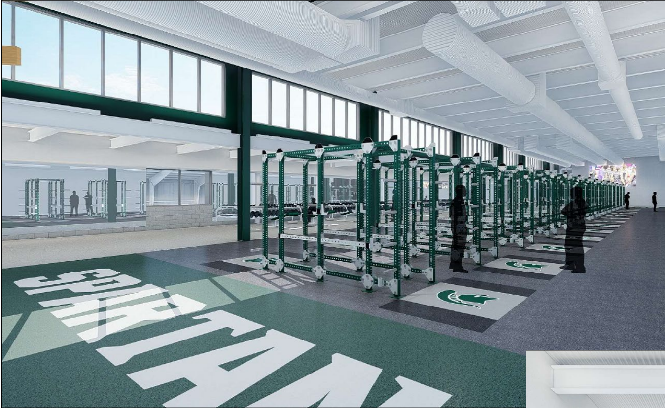
Right and above: Weight Room concepts