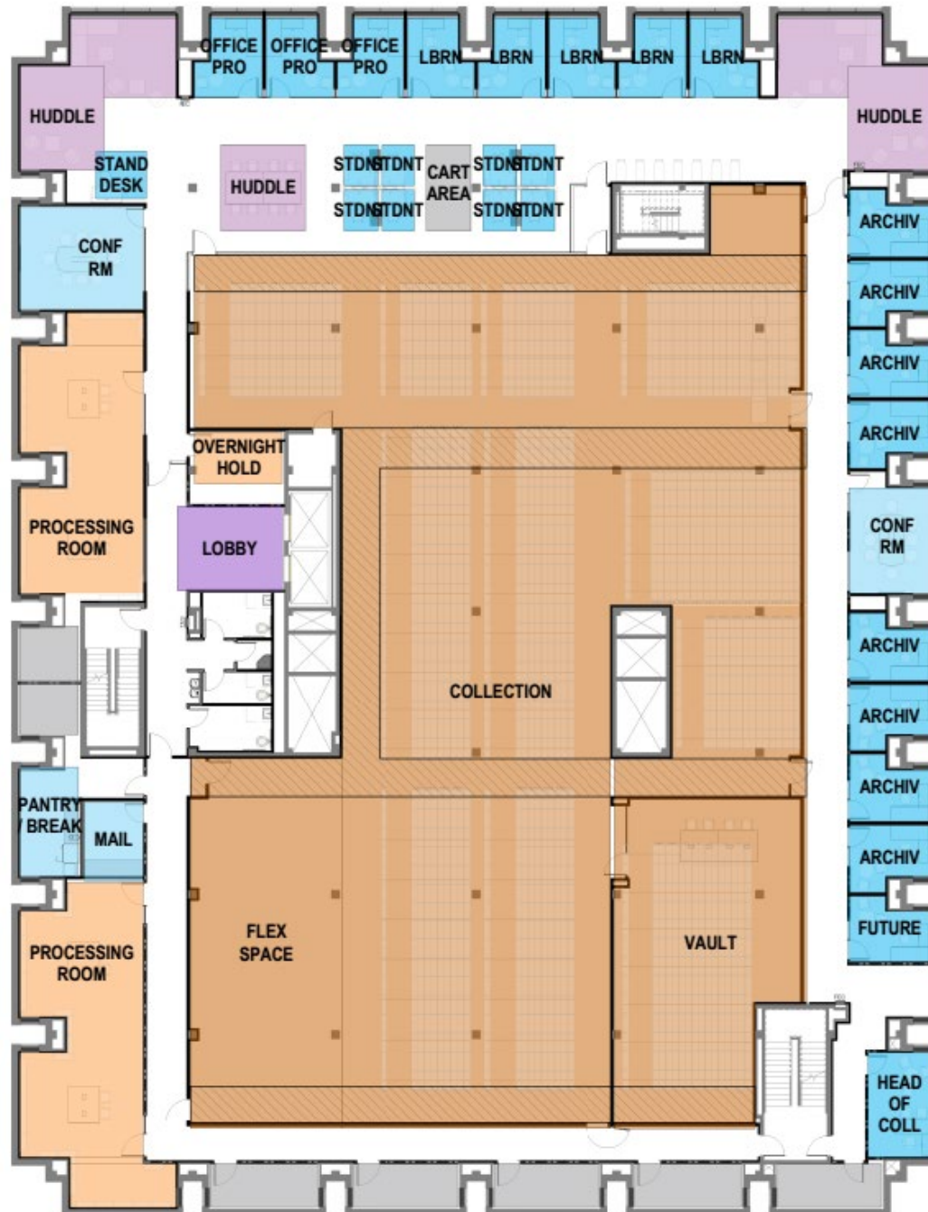
Main Library Third-Floor Renovations