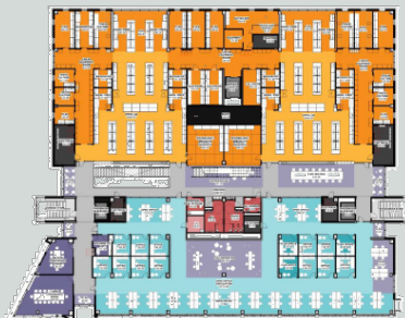
TYPICAL RESEARCH FLOOR