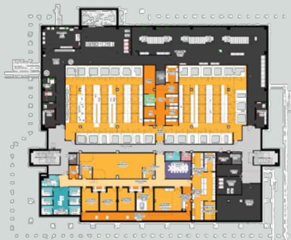
BASEMENT CORE FACILITIES